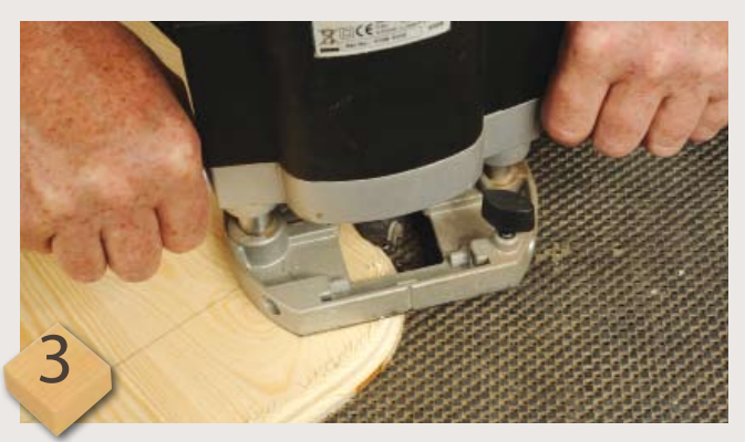
Jigsaw or bandsaw the top curves and sand to a smooth, even, finished shape. Use a small bearing guided ovolo cutter to run around the top edge, making sure you start and finish before the marked line of the cabinet top