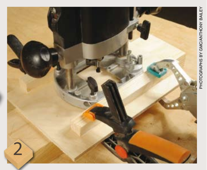
Glue and fix battens in place onto your plywood base so they allow the router to move in one direction only