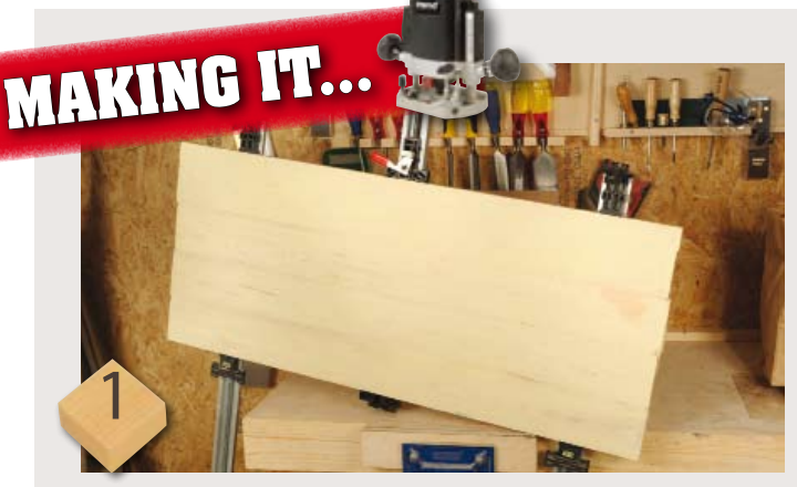
Cut and plane all components to width and length, except for top and bottom pieces and the door, which is trimmed to size later. If using solid wood for this you may need to carefully edge joint pieces together for the door and back panel – which should be thick enough to accommodate the piano hooks

• The door edge has a small ovolo moulding created by setting the cutter down enough to make slight step shapes.