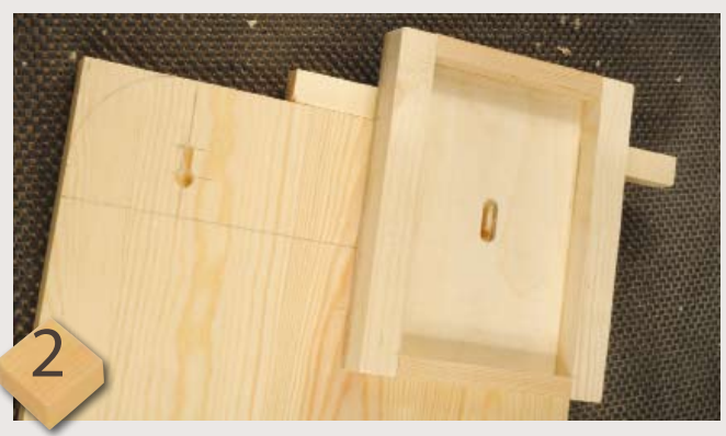
Mark out the cabinet top position on the backboard and the shape for the projecting top, also the keyhole positions on the reverse side. Use the keyhole jig to machine the keyhole slots while the top is still square