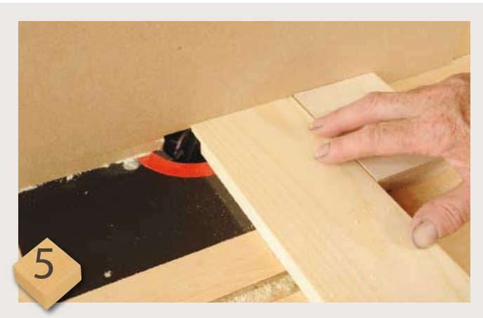
Use a tenoning cutter, or a 19mm straight cutter with a through fence in place to machine a rebate on the ends of the cabinet side pieces. Use a square cut push block behind for accurate support and to avoid breakout