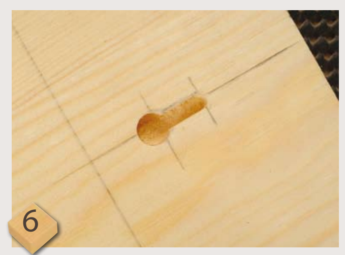
The resulting keyhole slot is neat and very functional