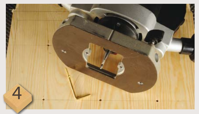
To make accurate holes for the piano hooks that hold the keys, a 3mm spiral cutter is ideal for drilling with the router. Use some abrasive taped to the baseplate if necessary, to stop the router from wandering