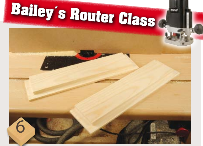
The cabinet sides are also rebated so they sit along the sides of the back panel without projecting too far, for aesthetic purposes. Do this at the same cutter and fence settings

Now cut the top and bottom to fit when the side pieces are in place. All components can be sanded and glued and pinned in place. For simplicity, the hinge recesses can be machined to the full depth of the folded hinge into the cabinet carcass, and simply surface fixed to the door. You don't need a jig for just two recesses, but you do need to clamp a batten along the cabinet side to give more support for the router and fence