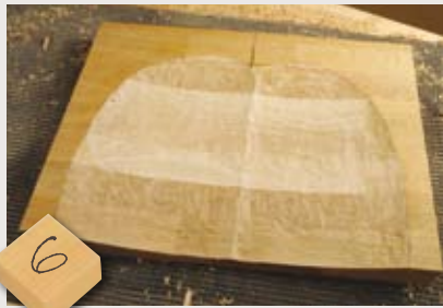
6 The finished ripple effect is pleasing to the eye and as a sitting test proved later, it is also very comfortable. A light sanding with a random orbital sander is enough to take off any rough edges left after the routing