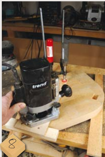
8 The jig has a batten at one end to press against the seat and is then clamped at the other end. When machining the front mortises, a strip of wood is placed between the jig batten and the seat to maintain the correct mortise centring