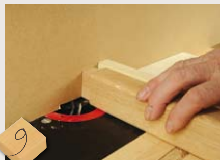
9 A Wealden tenoning cutter was used to machine the shoulders on the legs using a push block behind. A tight fit is essential and once that is achieved, the corners are nicked off with a fine tooth saw so they will fit in their holes