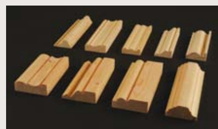
A selection of the many moulding styles possible using one or more cutters and your router and table

Last month I created a window frame using traditional style glazing bar cutters so this month, it seemed a good idea to consider other typical mouldings that make a room complete. Here, we are talking about skirting, architrave, dado (mid-height mouldings) picture rail and cornice. The last two are not so common these days in modern buildings, but they do help create a more traditional style of room. However, since the same mouldings, or ones like them, can be used when making other pieces, I have included examples of them anyway - a trick for making a plain panel door look more impressive is to fit a bolection moulding that sits around the frame edge, for example. So, there are various ways you can improve and enhance the look of a room and major fitments within it with mouldings.