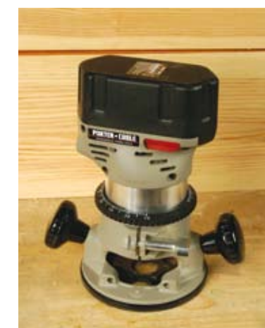
Porter Cable's discontinued cordless fixed-base router

Porter Cable from the USA did have a 192 volt model that could handle reasonably sized cutters and was a fixed base type, where you would the motor up and down inside the body. However, it got dropped from their range so one must suppose the demand wasn't that great – although it was quite well regarded. I think the technological problems of creating enough power and prolonged battery life in a machine that operates at such high speeds defeats power tool manufacturers, or at least isn't worth the investment, so just hitch that cable from the ceiling out of your way and keep an extension lead handy. ■