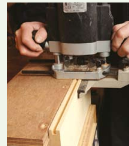
Edge slotting with an L-jig