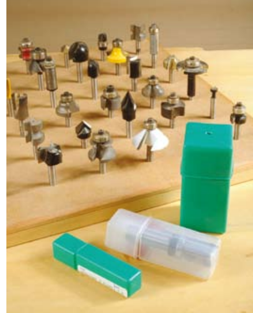
Proper cutter storage

quickly. Because the cutting edges are machined from one piece of solid steel these cutters will often have a swept waveform from the cutting edge to the middle of the cutter which helps the chippings escape easily. However, English manufacturer Titman make a range of TCT cutters intended for softwood; this is done by altering the cutter geometry so the cutting edges are more acute and slice the wood better. These cutters should fare better than HSS if they hit a knot or other defect.