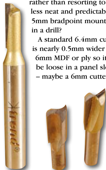
Left: Single flute Right: HSS and twin flute

A standard 6.4mm cutter is nearly 0.5mm wider than 6mm MDF or ply so it can be loose in a panel slot – maybe a 6mm cutter