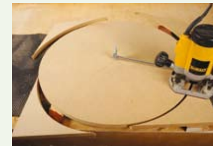
Quick circle cutting with a trammel