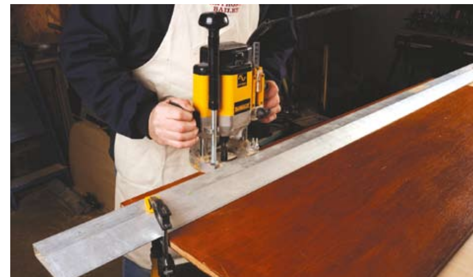
Trimming a board edge smooth