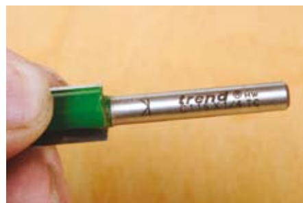
Safe working shank depth mark