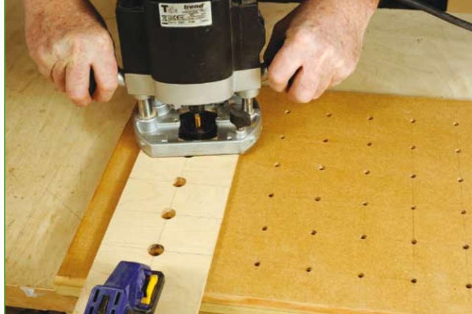
This jig makes hole drilling very easy

sizes so you never run out of a sharp cutter. Kitchen worktop installers can buy sets of three or four cutters of the same size for this very reason.