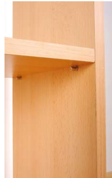
Discreet shelf studs

The standard sizes such as 6.4mm, 9.5mm, 12.7mm, 16mm and 19mm tend to get a pounding and often end up rather scorched and worn. It makes sense to have duplicates or even triplicates of the most used