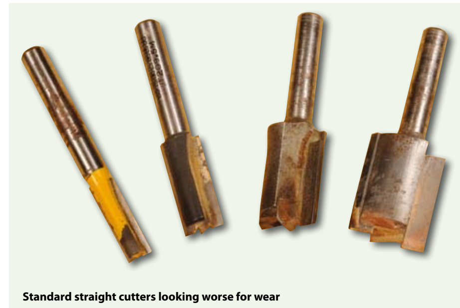
Standard straight cutters looking worse for wear