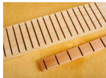
Dentil mould and frieze can be done using a jig