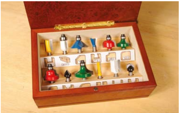
Left: A good quality starter cutter set. However, it may not contain all of the profiles you really need

Overleaf are a few applications for standard one- or two-bladed TCT – tungsten carbide tipped – straight cutters.