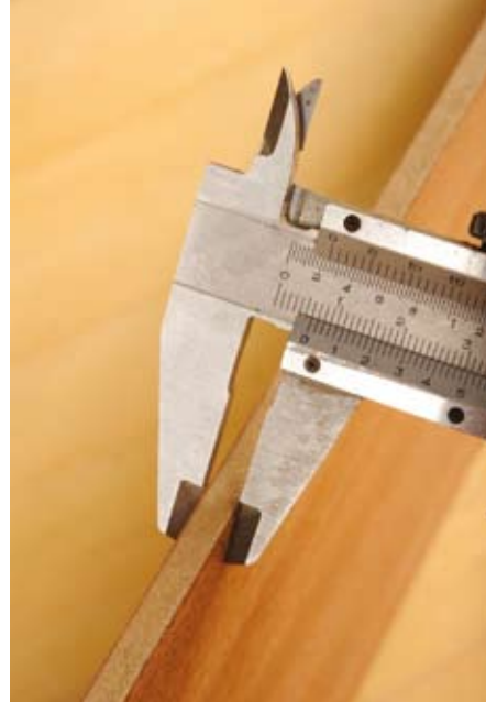
Board thickness is variable

Twin flute cutters are available in sizes from 1.5mm diameter upwards to a