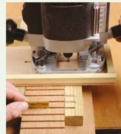
A frieze jig in use