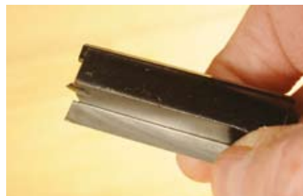
A good thin, even brazing line

While TCT is pretty universal among router cutters there are times when HSS has the edge, so to speak. It is primarily used with softwood or at least softer wood. It is intrinsically sharper than TCT but that finer cutting edge is lost much more