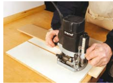
Slotting using a T-square