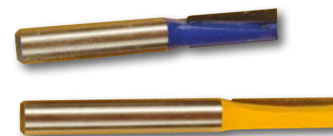
Use a longer shank cutter in a table