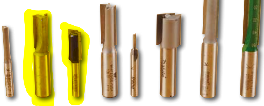
A variety of straight cutters