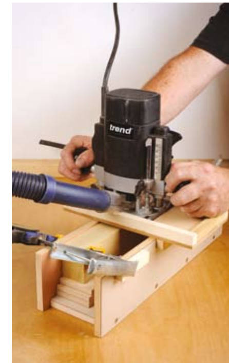
A mortise box makes joints easy to do