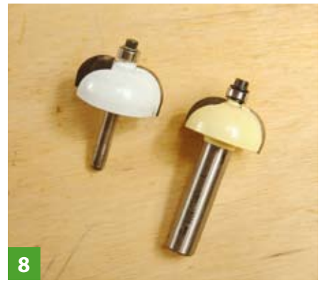
The cutter on the left is really too big for the shank; the one on the right is well supported by a much bigger shank