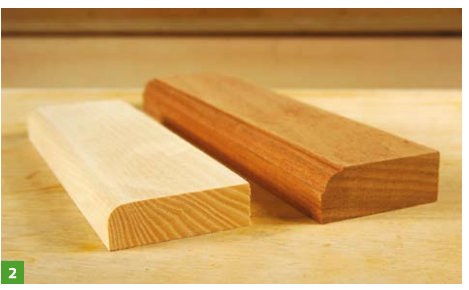
Although not an absolute rule, light coloured woods suit contemporary styling and mahogany type woods the more traditional appearance with more intricate mouldings

4 When producing any piece of furniture or joinery raw edges have the potential to not only hurt on contact but also to produce vicious splinters, sometimes quite large ones. Normally the minimum requirement is to 'break' the arris. This means lightly sanding a raw corner to take away any sharp or hazardous