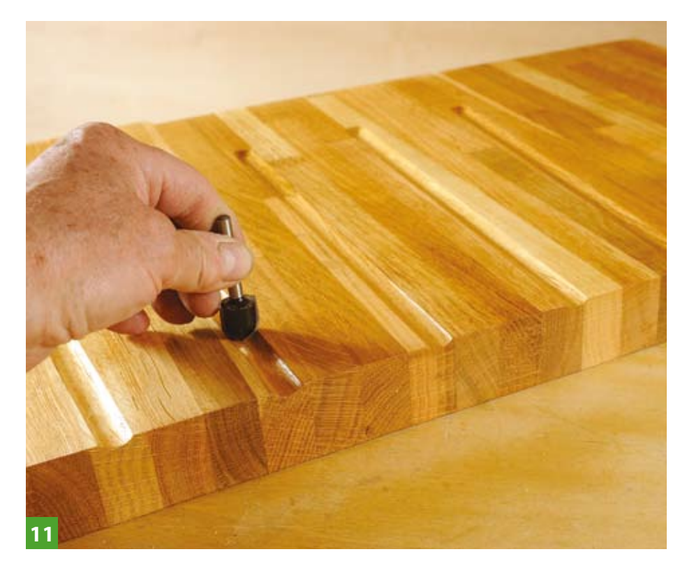
The corebox is ideal for creating sink water run offs on wooden draining surfaces

The corebox – sorry, I don't know the origin of the name - tends to be reserved for a column fluting effect on reproduction furniture or more practical uses such as window sill drip grooves or on kitchen worktop draining surfaces. It can also be used to create coves, especially in larger sizes where some form of guidance is used. Corebox cutters do not have bearing guidance or they would be cove cutters instead. The exception would be where a bearing is fitted above the cutter for template following.