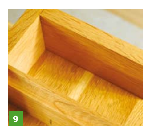
This carcass exterior looks OK square but the undercut cove for the shelf relieves the look of this unit

10 You can buy matched roundover and cove cutters intended for creating rule joints on