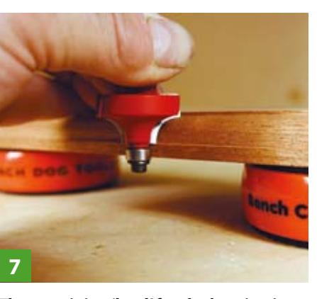
The remaining 'land' for the bearing is only just wide enough and may not look right either, a smaller roundover would be better

7 Traditional furniture tends to be more ornate, even in the simplest styles. There will be square edges but less of them and the use of an ovolo is useful to reduce the bulk of an otherwise unbroken edge. Choosing the right size ovolo is partly taste and partly based on material thickness. It can be instructive studying antique furniture to see how mouldings have been used in the past. In the case of an ovolo it is pointless using it if there isn't much of a step left behind as it will look wrong and be precarious, as the bearing could slip off the remaining unmoulded edge. With any bearing guided cutter you must of course leave enough material for the bearing to run against.