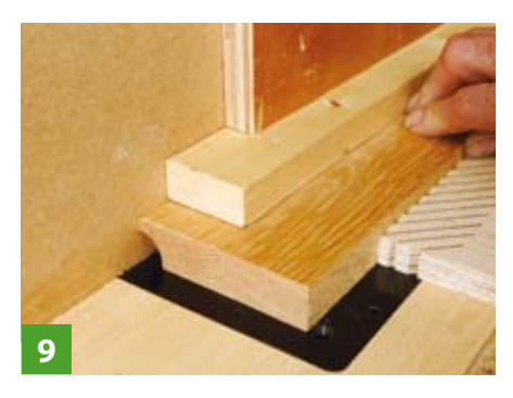
Cove cuts in particular need extra support to avoid the work chattering and the moulding being marred as a result of this

8 Larger size cutters are better on ½in shanks, especially cove cutters, as the strain is less on the shanks and more power is available.