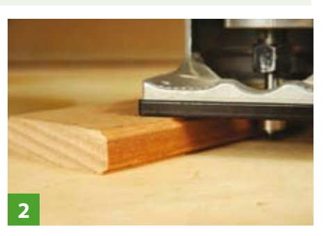
Even a roundover cutter can create a one step ovolo type effect as for a shelf shown here