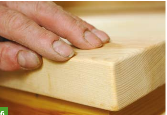
This kitchen worktop has a small 3.2mm radius roundover for comfort and appearance