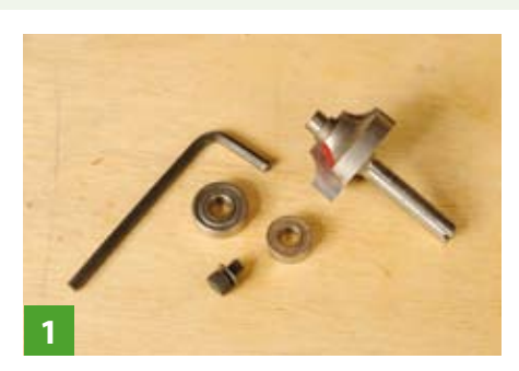
Two bearings give the option of a roundover or an ovolo without buying two dedicated cutters