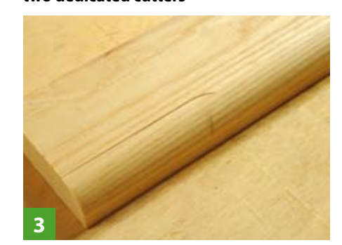
Always set the cutter depth up a fraction to avoid creating a ridge line that cannot be sanded out

When using a cove cutter, the 6 depth of each pass needs to be less the deeper you go, as the cutter will remove an increasingly large amount due to the profile shape.