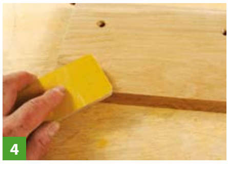
If you don't use a moulding the edges should at least be lightly and evenly abraded instead

A bevel effect tends to look better on oak rather than rounding over the arrises