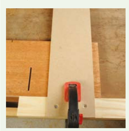
Biscuit cutter sets can only do slots that aren't far from the router base such as carcass edges. For mid panel cuts use a 4mm straight cutter and a router T-square for guidance