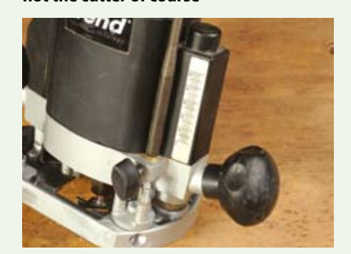
It is critical that you do not unplunge the router or the slots will get damaged. Make sure the plunge lock is firmly applied. A few routers allow you to lock the router positively at a fixed height - some fine adjusters can also do this for you