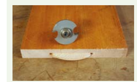
Slot cutters are a much smaller diameter than a jointer cutter. This means making an elongated slot in order to create the right length of slot