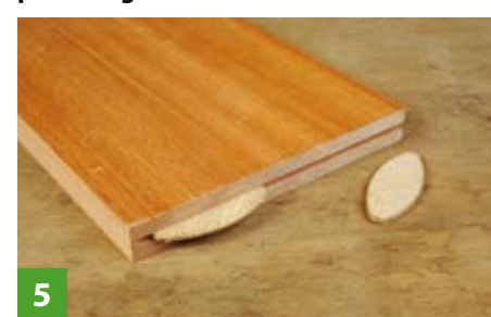
Making shelf end slots