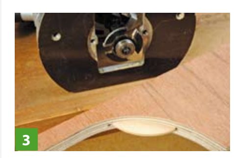
Working around tight curves