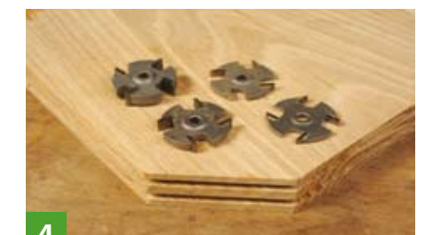
Creating decorative features especially if part of a groover set