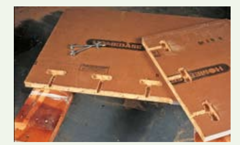
Kitchen table joints are often biscuit Kitchen table joints ... jointed as well as using worktop bolts because it keeps the dogleg joint level. A standard biscuit jointer cannot get close to the dogleg but a router biscuit can do so easily