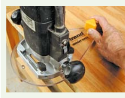
To give better balance especially when making long slots, use an offset base with a knob to hold it down and give more control