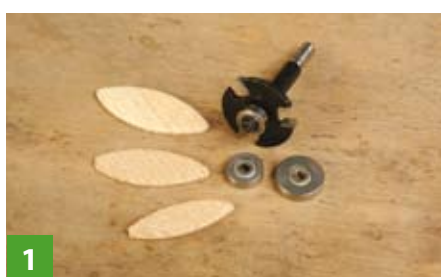
Capable of machining three standard biscuit slot sizes