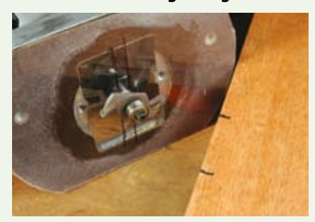
It is difficult to see where the slots begin and end when machining. Fix a piece of clear plastic on the router base as you would for drilling with crosshairs, but in this case a start and stop line for the shank not the cutter to match your workpiece marks