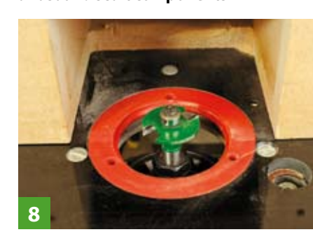
Static biscuit slotting