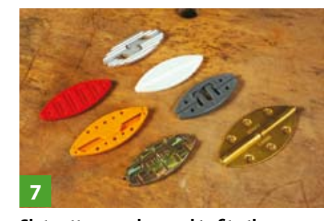
Slot cutters can be used to fit other more unusual biscuit components